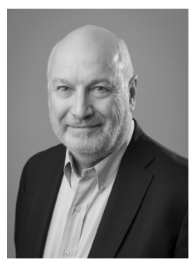
1000 x 1500 vert bw