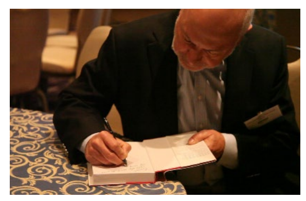
1204 x 772 horiz