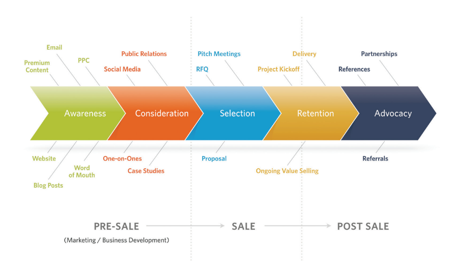
Figure 3. Professional Services Client Experience Journey.

With content marketing, your A/E/C firm is visible at every stage of the buyers' journey: pre-sale, sale, and post-sale. But, just producing content is not enough.