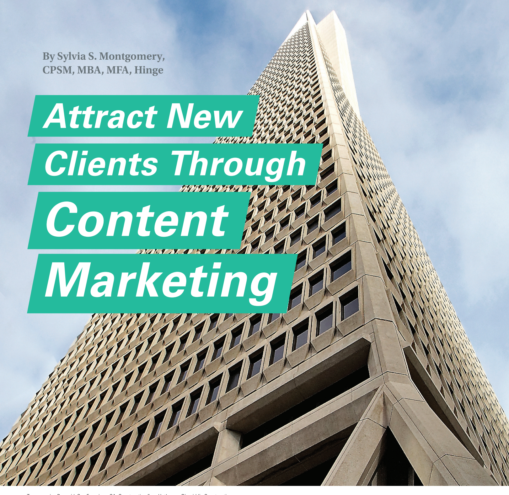
Transamerica Pyramid, San Francisco, CA. Construction firm: Hathaway Dinwiddie Construction Company

By now, we have all heard about content marketing (thought-leadership marketing) and its role in nurturing clients and prospects. For at least five years, we've heard stories of how firms have gained clients and are actively connecting with prospects with the help of content marketing. Yet, A/E/C firms continue to distrust this notion. Why?